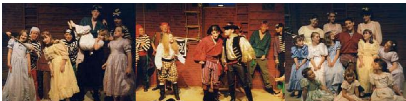
The Pirates of Penzance in Bladon in 1999